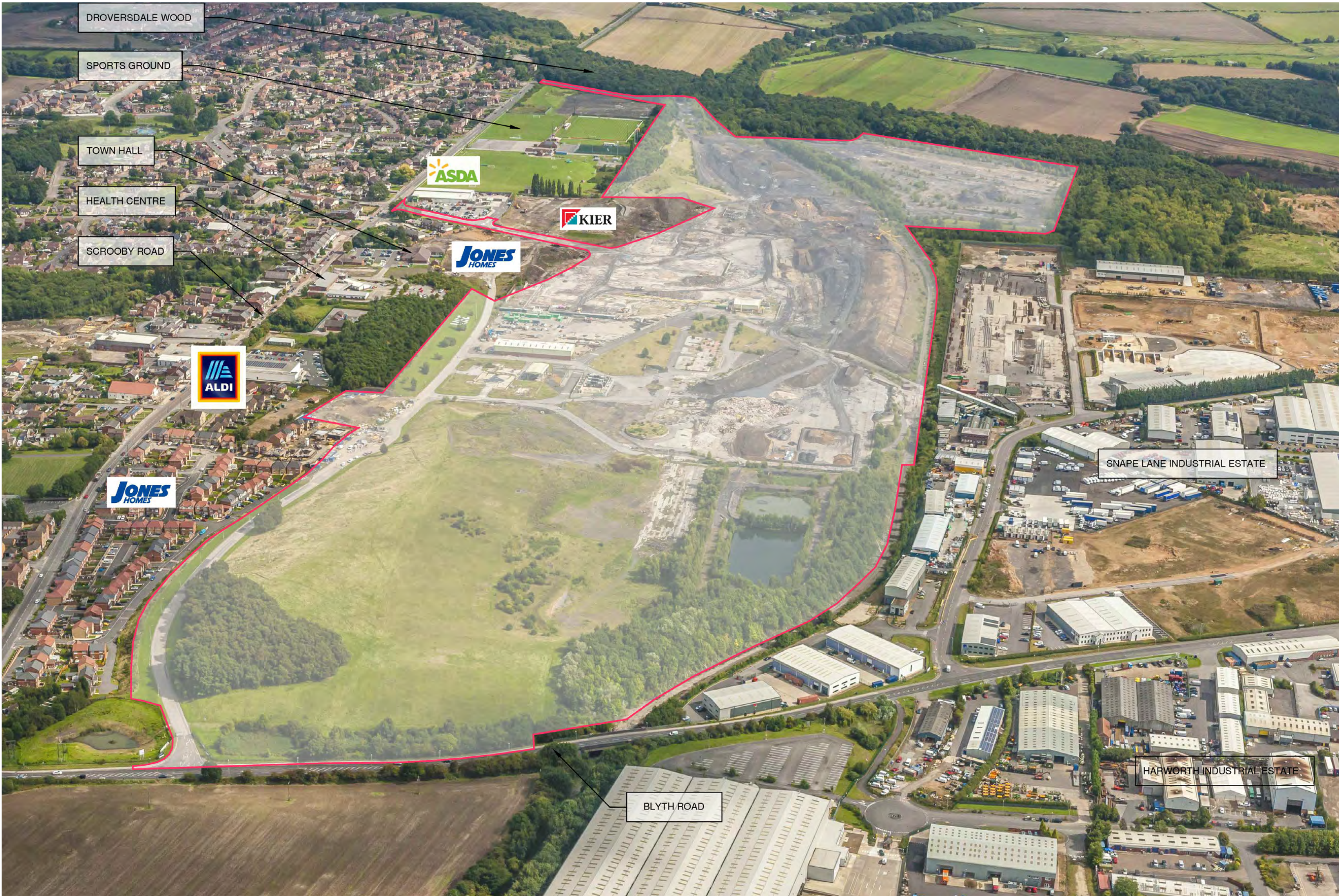
Aerial Photograph Showing Application Boundary